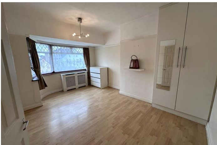
KITCHENER ROAD, DAGENHAM £2,200 PCM