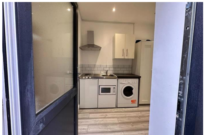
EAST ROAD, CHADWELL HEATH, ROMFORD £1,000 PCM