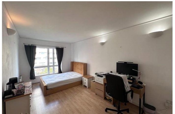
FLAT , MAURER COURT, JOHN HARRISON WAY, LONDON £2,400 PCM