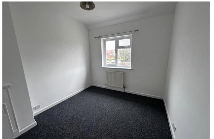
WINTERBOURNE ROAD, DAGENHAM £1,900 PCM